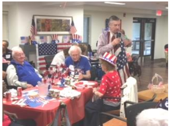
August Village Summer Bash.

All in attendance had a blast at the Tenant's Association Summer Bash.