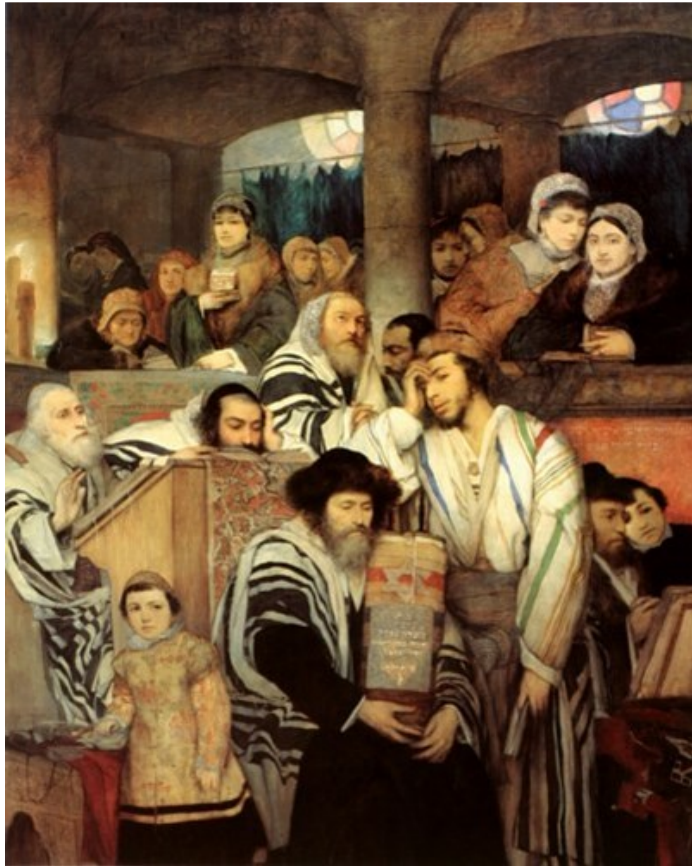
“Jews Praying in the Synagogue on Yom Kippur” (1878) by Maurycy Gottlieb, Tel Aviv Museum of Art